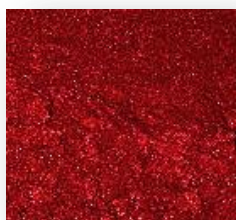
Majestic Velvet Merlot